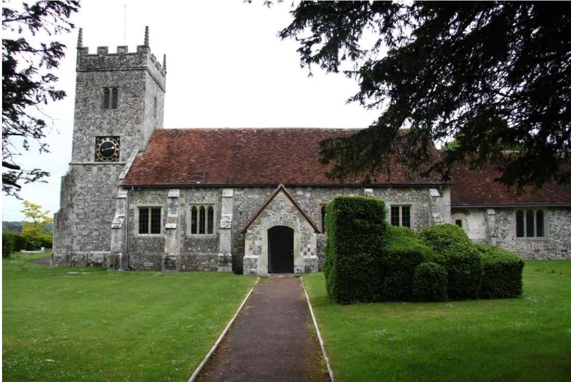
St. Lawrence Church, Stratford-sub-Castle

During the two world wars, the United Kingdom became an island fortress used for training troops and launching land, sea and air operations around the globe. There are more than 170,000 Commonwealth war graves in the United Kingdom, many being those of servicemen and women killed on active service, or who later succumbed to wounds. Others died in training accidents, or because of sickness or disease. The graves, many of them privately owned and marked by private memorials, will be found in more than 12,000 cemeteries and churchyards. Most of the 47 First World War burials in Stratford-sub-Castle (St Lawrence) Churchyard were made from the local hospital and more than half of them are of Australian servicemen who were based at the many Australian depots and training camps in the area. There are also two burials of the Second World War in the cemetery. ( Information from CWGC )