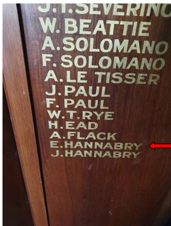
Evansford Honor Roll