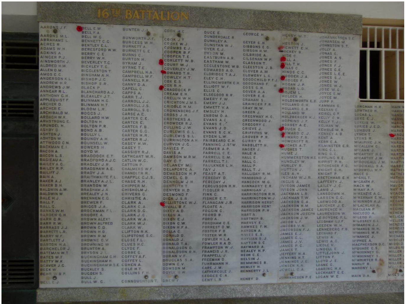
16th Battalion Panel