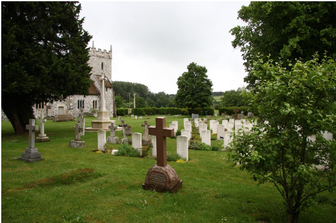
Churchyard of St. Lawrence, Stratford-sub-Castle with CWGC Cross of Sacrifice